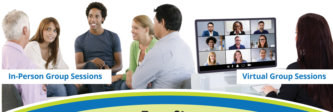
In-Person Group Sessions

There's never been a more important time to quit.