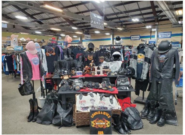
PCB Parkway celebrated Bike Week from May 5th to May 7th. The display and the outfits looked amazing team!