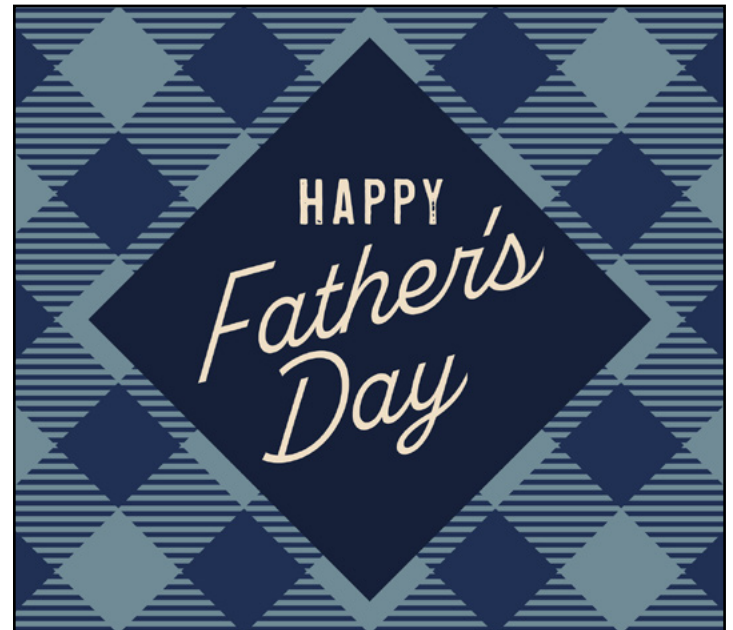
Father's Day - Sunday, June 16