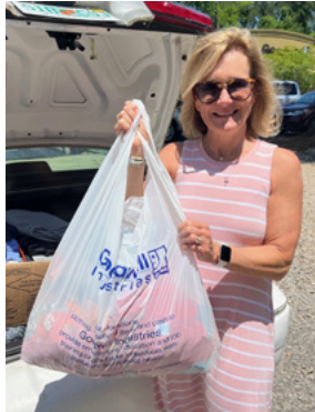
Goodwill partnered with the Florida Senior Living Association to provide donated clothing for senior adults displaced because of the May 10th tornadoes in Tallahassee.