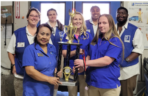
Shoutout to the Crestview Store for being the March EComm Contest winners.