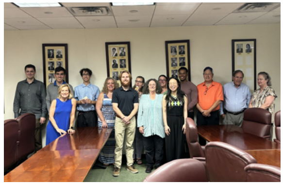
The May Birthday Celebrations at the Mabry Office