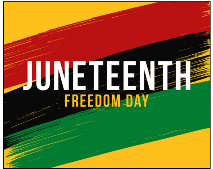
Juneteenth - Wednesday, June 19