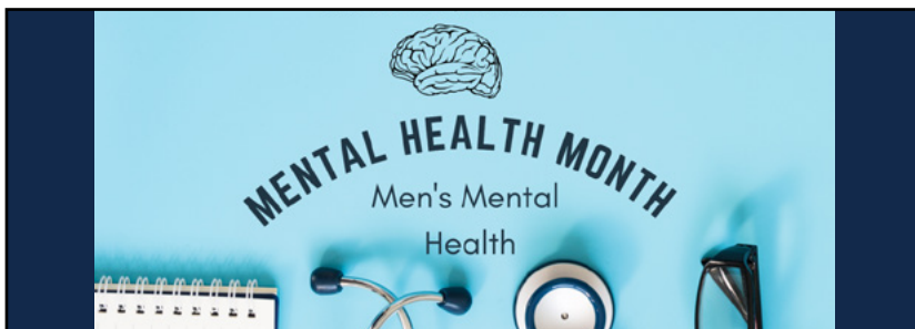
Men's Mental Health Month