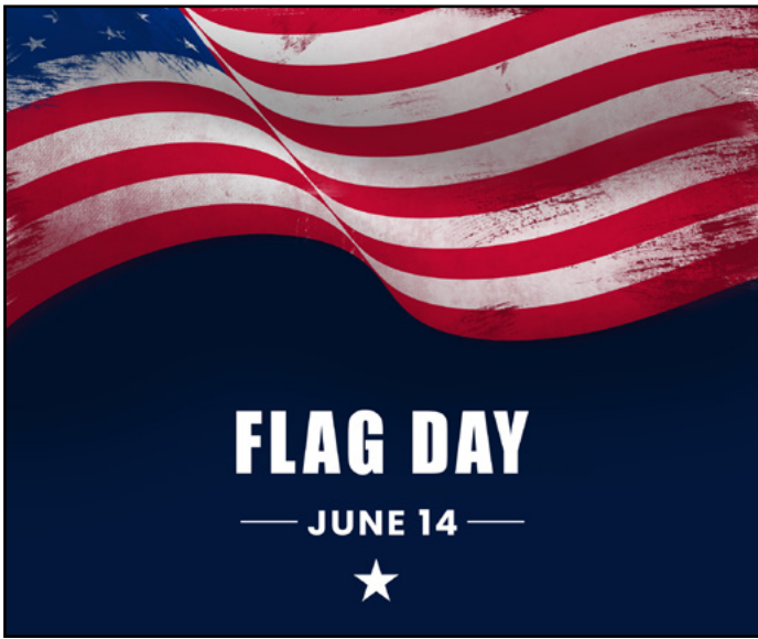
Flag Day - Friday, June 14