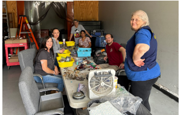
E-COMMERCE sorting jewelry after the tornado